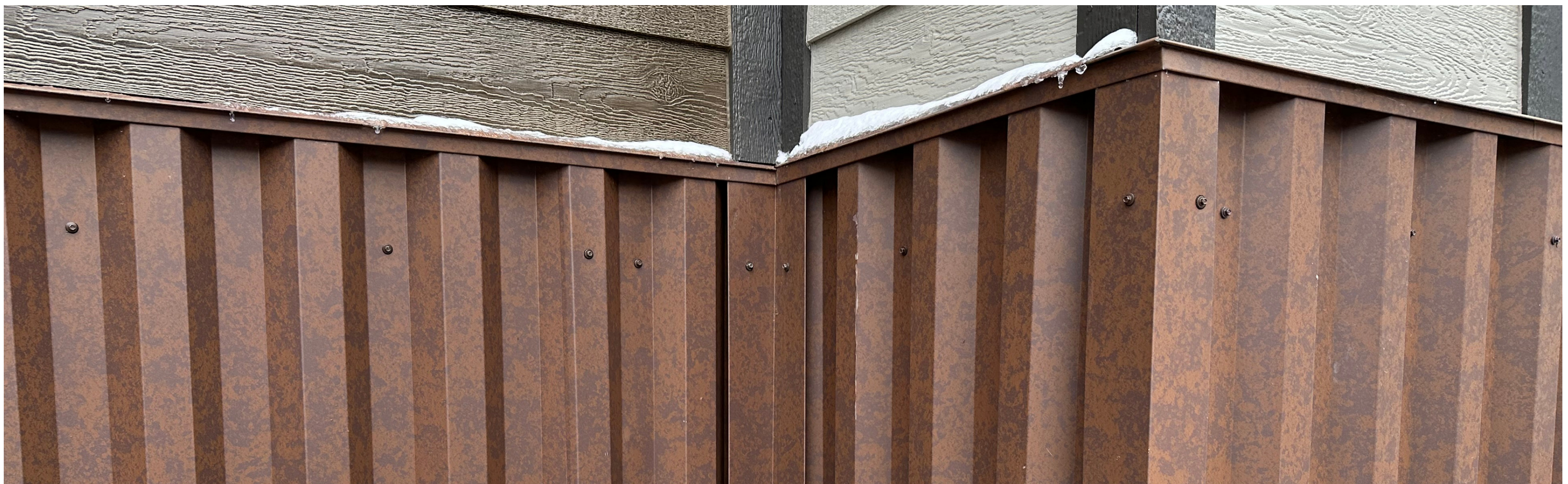
7.2 Corrugated Panel shown in Western Rust